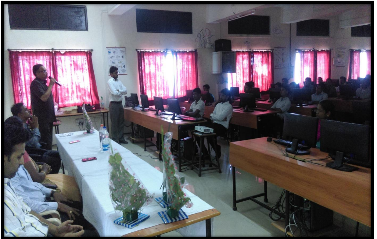
Inauguration of STAAD pro Workshop