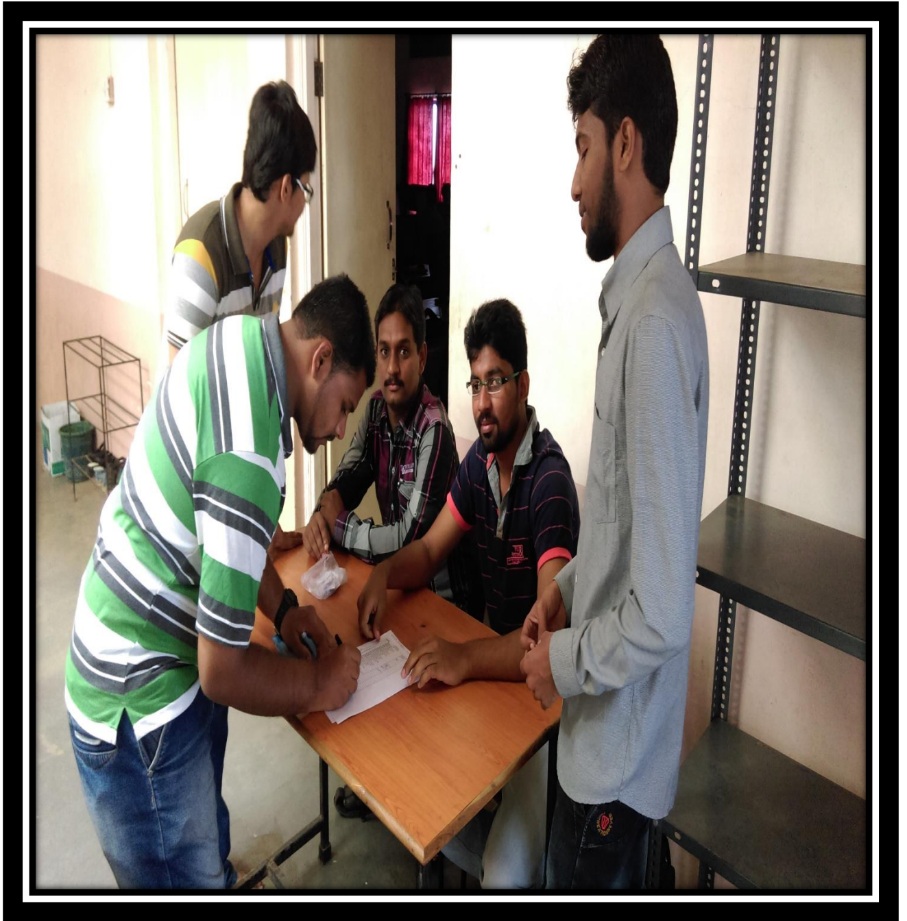
Registration window for STAAD pro Workshop