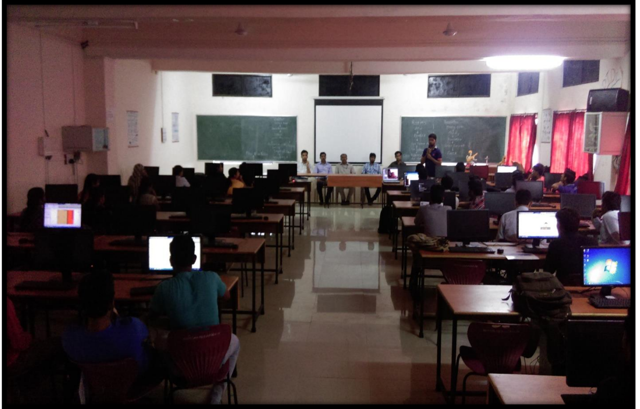
Inauguration of STAAD pro Workshop