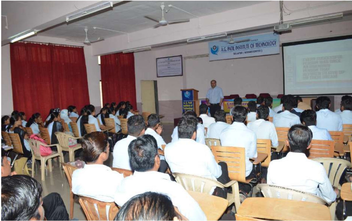
PHOTOGRAPH OF PARTICIPANTS OF EAC: 2018-19